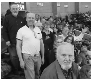
The Emanuel Synagogue Brotherhood sponsored a January outing to Gampel Pavilion in Storrs to watch the UConn Lady Huskies basketball team defeat Tulsa University Ladies by a 58-point margin.