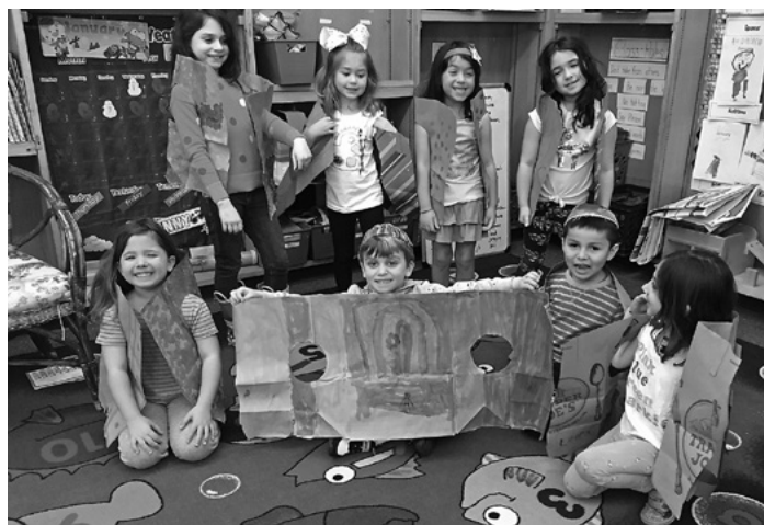
Kitah Gan shows off their coats of many colors.