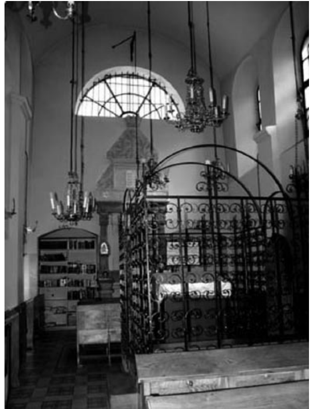
Interior of Remu'h Synagogue with the bimah in the foreground.

On Sunday, July 5, the final full day of the convention/pilgrimage, the main event was a concert at the Krakow Philharmonic Hall entitled "An American Songbook in Honor of Independence Day." Eleven cantors presented a beautiful performance of American standards and theater music written by Jewish composers who had ties to Poland.